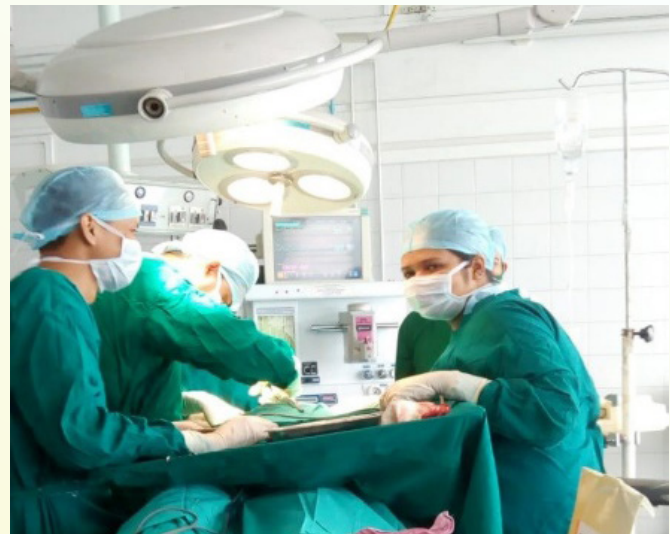
ACCF Nurses training - Assisting surgeon in axillary radical mastectomy