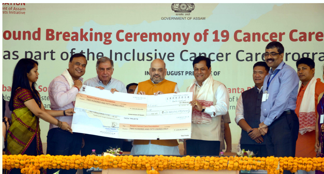
Partnership initiation between The Government of Assam and Tata Trusts.