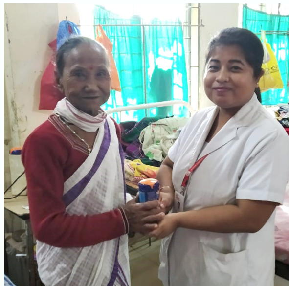
Bonding between health care providers and patients

Since then, the centre has successfully provided palliative care through more than 2300 consultations and 845 new patients referred from various departments of AMCH. The unit has catered to the needs of not only people from nearby areas but, from far flung areas like Darrang - which is at a distance of over 400 kilometres from Dibrugarh and even from neighbouring states like Arunachal Pradesh. Besides OPD, the unit also extends its services to inpatients with cancer in various departments.