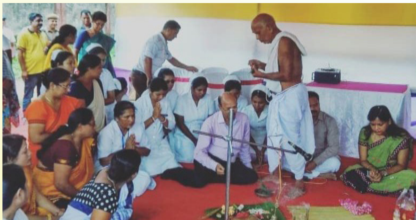
Bhumi Pujan performed for building cancer care facilities in Assam in June 2018