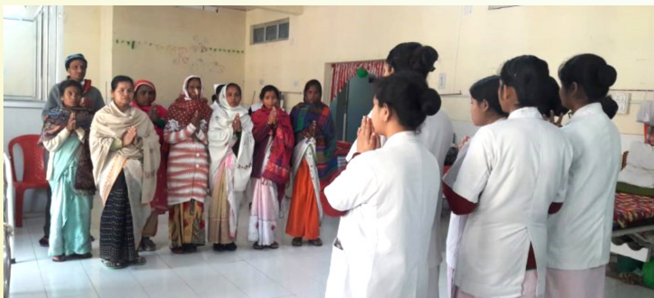
Meditation Session regularly held at PCU - Dibrugarh

In an endeavour to spread awareness on palliative care, the unit has integrated with B.Sc. Nursing College and GNM Nursing College. The 3rd year nursing students from these colleges are regularly posted in the unit for clinical exposure. Theory classes are also being organised on palliative care topics for them.