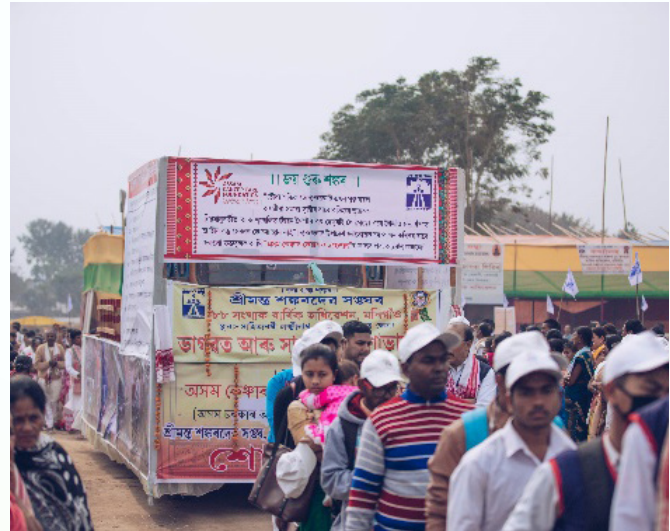
ACCF at Sankar Sangha Festival – Morigaon, 2019