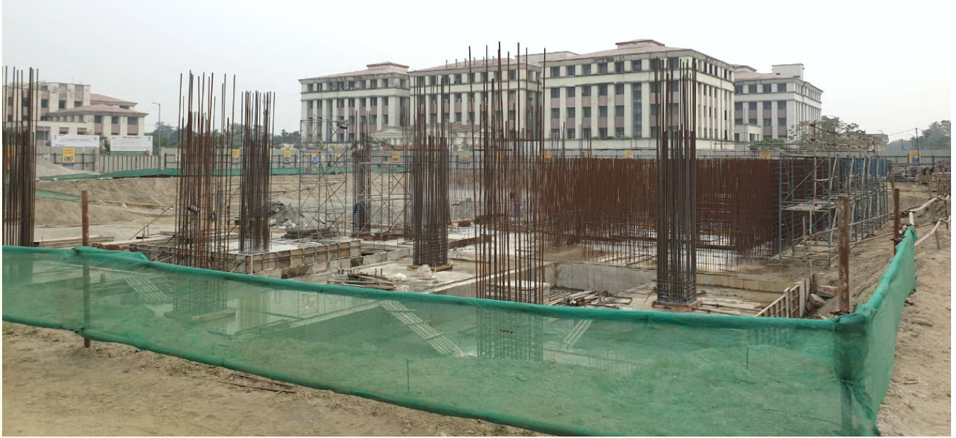
Foundation work in progress at Barpeta Site

Of these ten locations, construction has gained momentum in Guwahati, Dibrugarh, Barpeta, Tezpur, Lakhimpur and Jorhat.