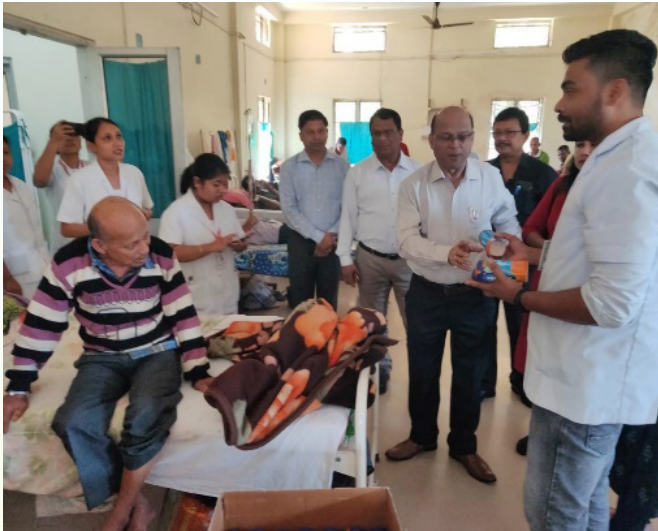
Palliative Care Units at Assam Medical College and Hospital - Dibrugarh, Jorhat Medical College and Hospital - Jorhat and State Cancer Institute – Guwahati