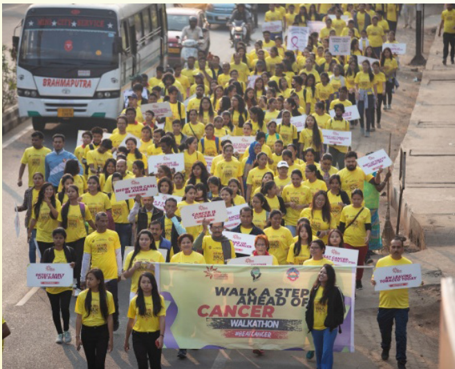
Walkathon on Cancer Awareness organised by ACCF on the occasion of second establishment day of State Cancer Institute